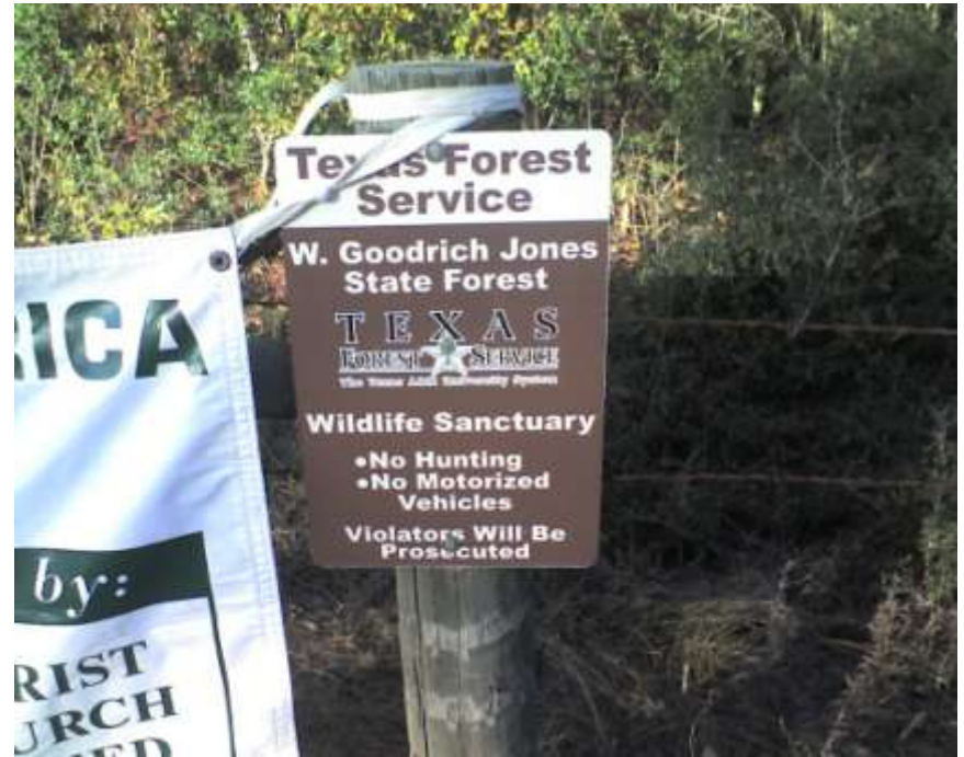
Entrance to Camp Dimora