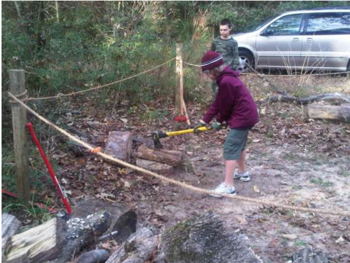
Camp Dimora – A World Class Ax Yard