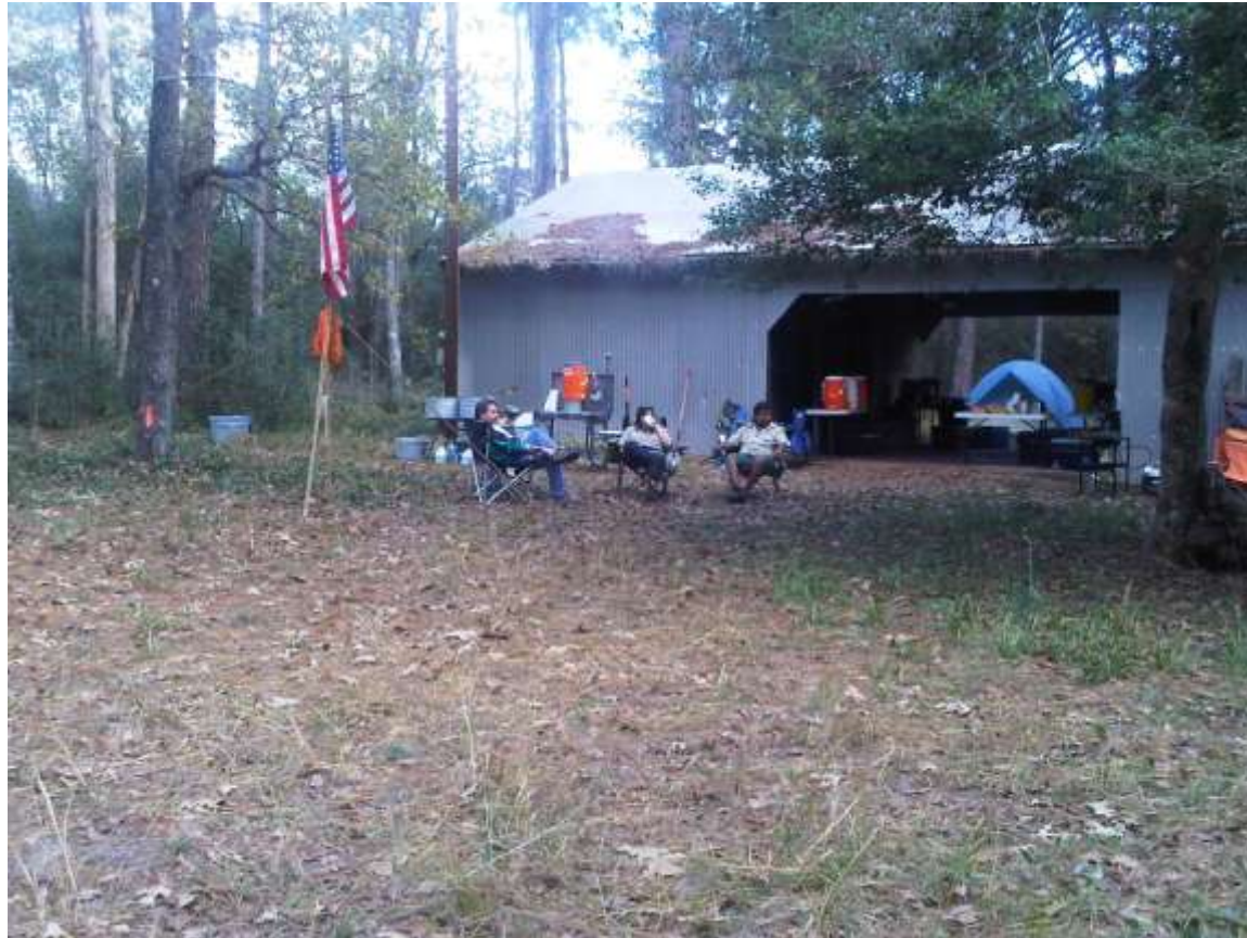
Camp Dimora – Great Place to Relax