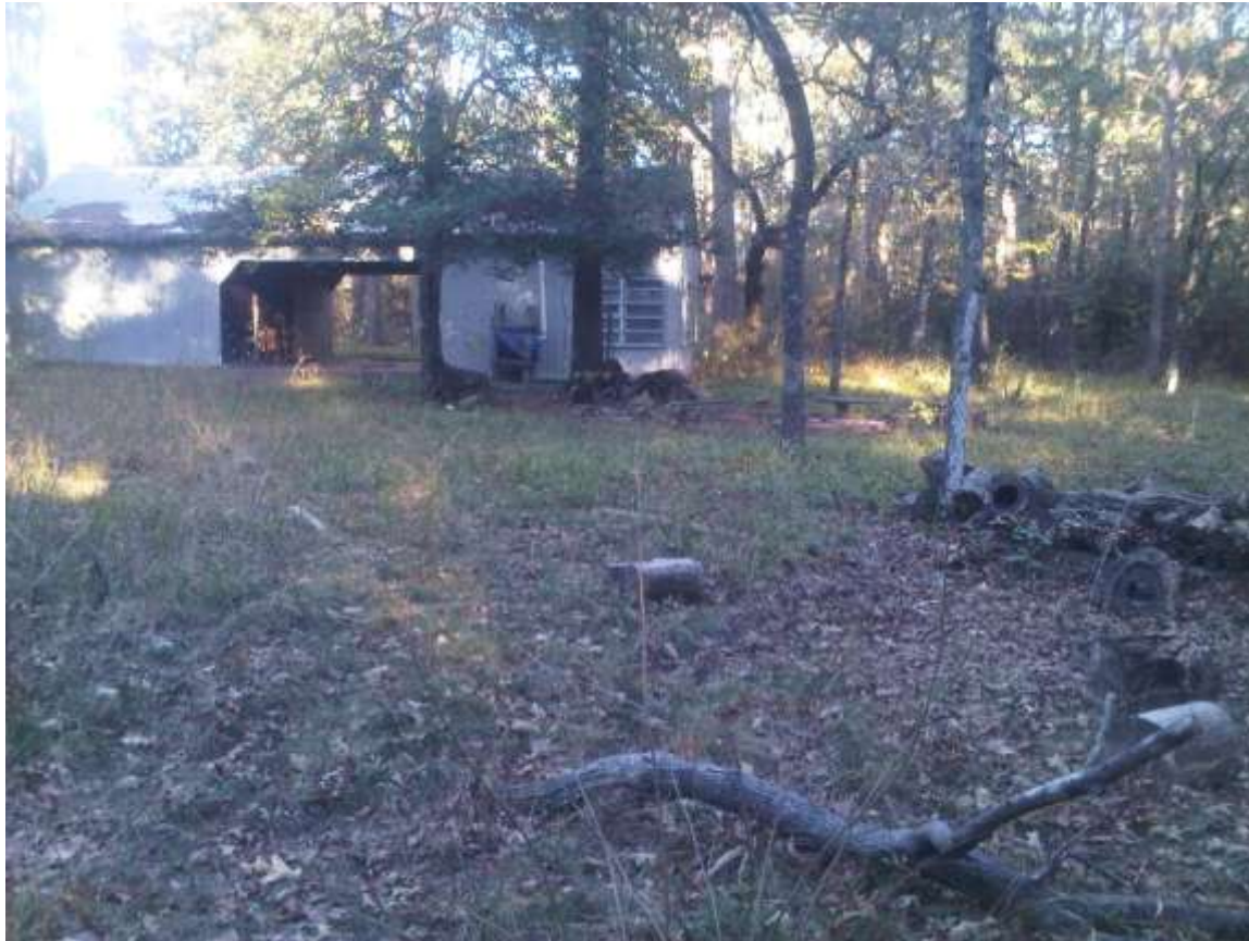
Camp Dimora - A Primitive Camping Experience Right in Your Backyard