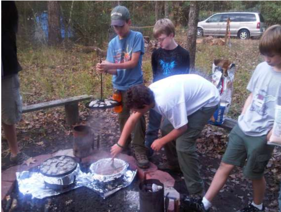
Camp Dimora – Dutch Oven Cooking