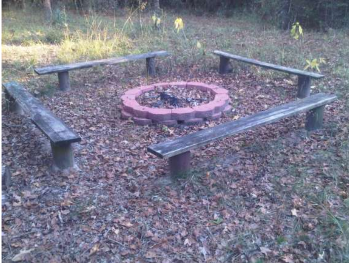
Camp Dimora – Great Campfire Ring!