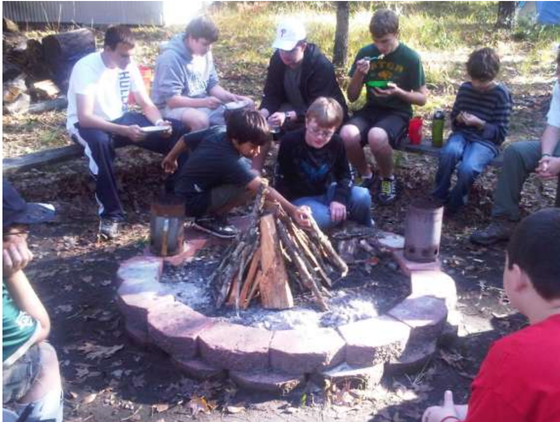
Camp Dimora – Campfire Building!